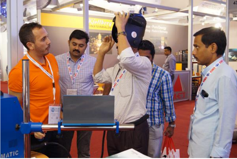
The virtual welding trainer on DVS's joint booth met with great interest amongst the visitors.