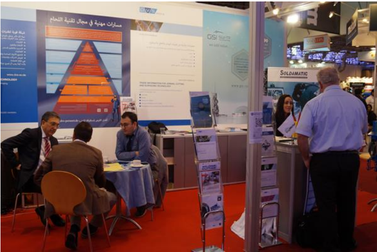
On the joint booth of the German Welding Society (DVS), DVS Media GmbH, GSI SLV-TR and Messe Essen GmbH, attention centred on discussions about educational subjects.