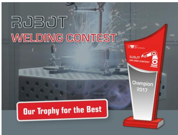
The contestants ranked in the first places in the ROBOT WELDING CONTEST will also receive, amongst other prizes, trophies with their names and the names of the manufacturers with whose robots they have carried out the welding.