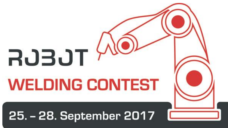
The logo of the ROBOT WELDING CONTEST 2017.